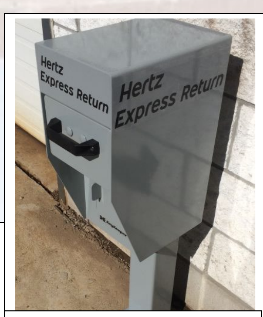
KeyKeeper WB Withstand