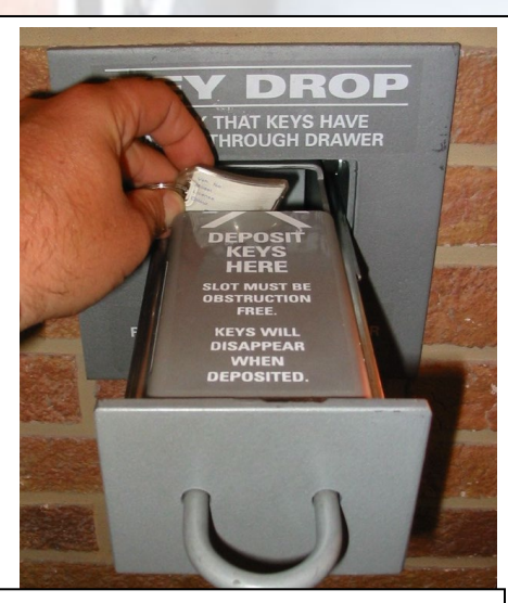
KeyKeeper Standard / ShortStalk

Sizing guide available for proper model selection.